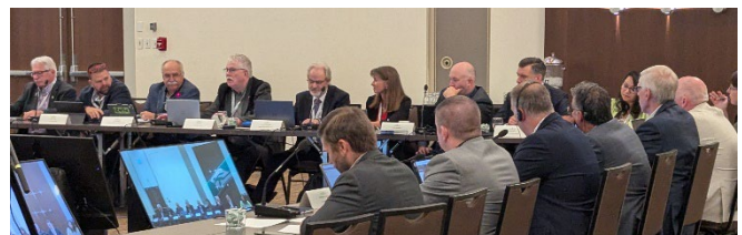
CFA Board Meeting