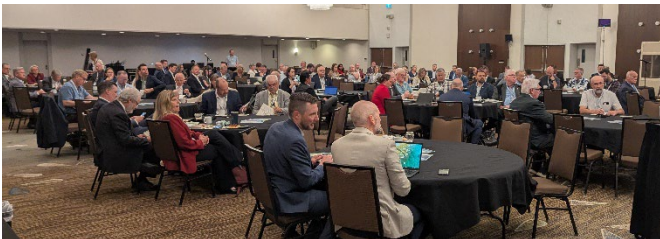
The CFA Board Meeting and Policy Summit, dove deep into some of the pressing issues of Canadian agriculture:

Managing Rising Input Costs - Strategies on securing essential farming inputs amidst escalating prices and supply constraints.