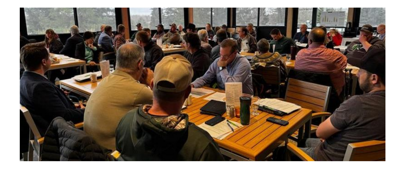
Top: District 5 & 6 on Monday, November 4th in Saskatoon Middle: District 2 & 3 Tuesday, November 5th in Assiniboia Below: District 1 & 4 on Wednesday, November 6th in Yorkton